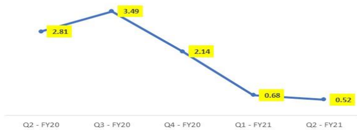
Cash Out - Operating Activities (in $A million)

In this Q2FY2021, the Company registered a further reduction of 22% operating cash outflow compared to Q1FY21 (A$675,244). The Company expects bottoming of operating cash outflow in Q2FY21 in line with expectation of increased business activities in Q3FY21 following the completion of the recent fund raising exercise.